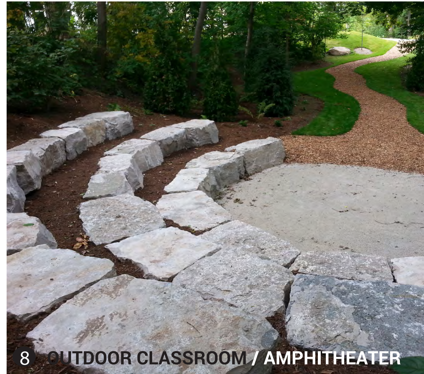
8 OUTDOOR CLASSROOM / AMPHITHEATER