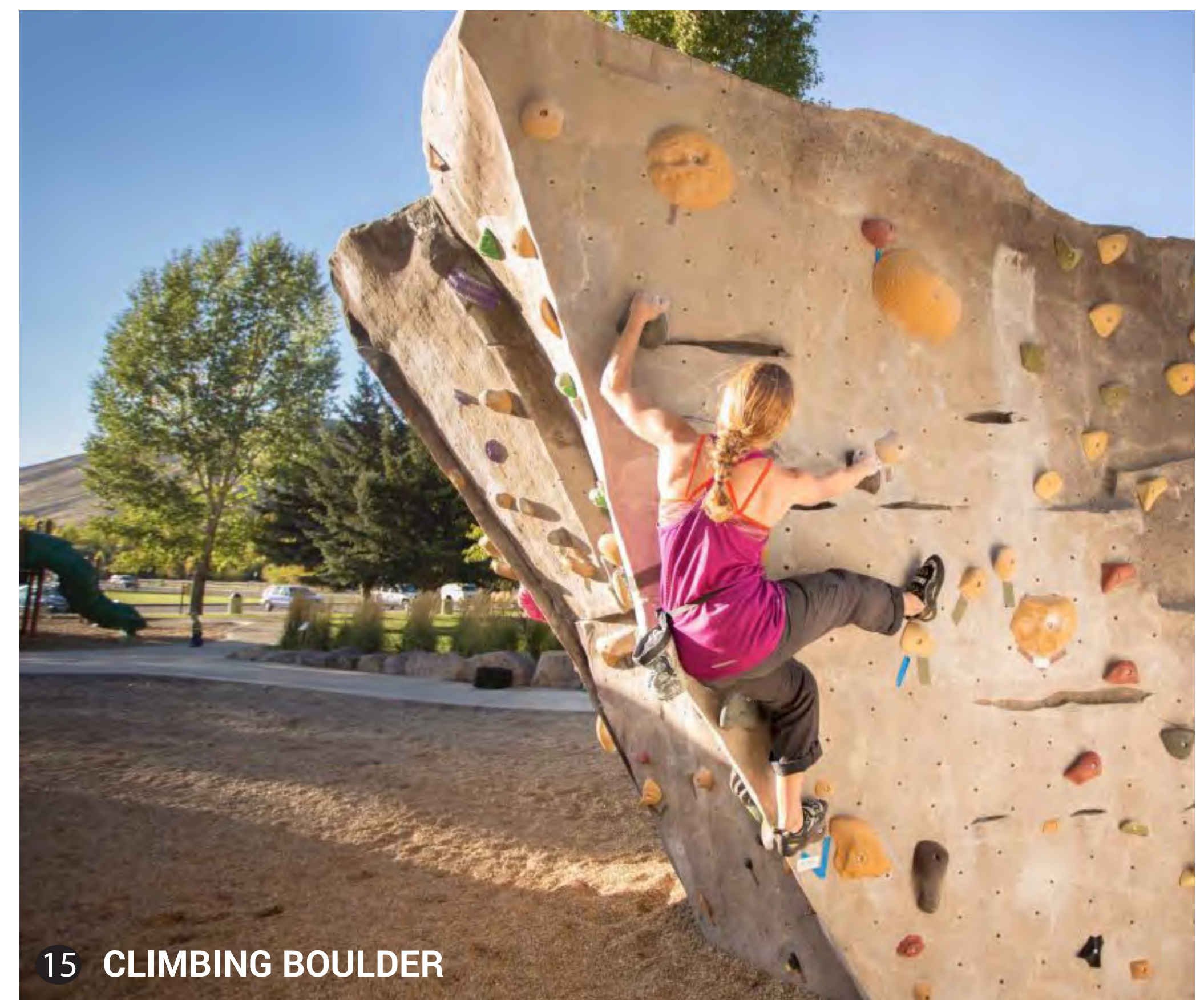
15 CLIMBING BOULDER