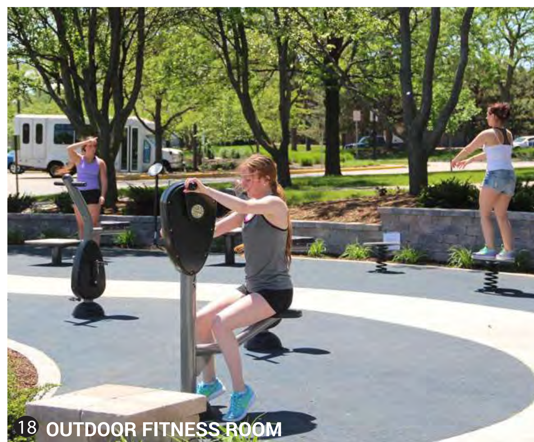
18 OUTDOOR FITNESS ROOM