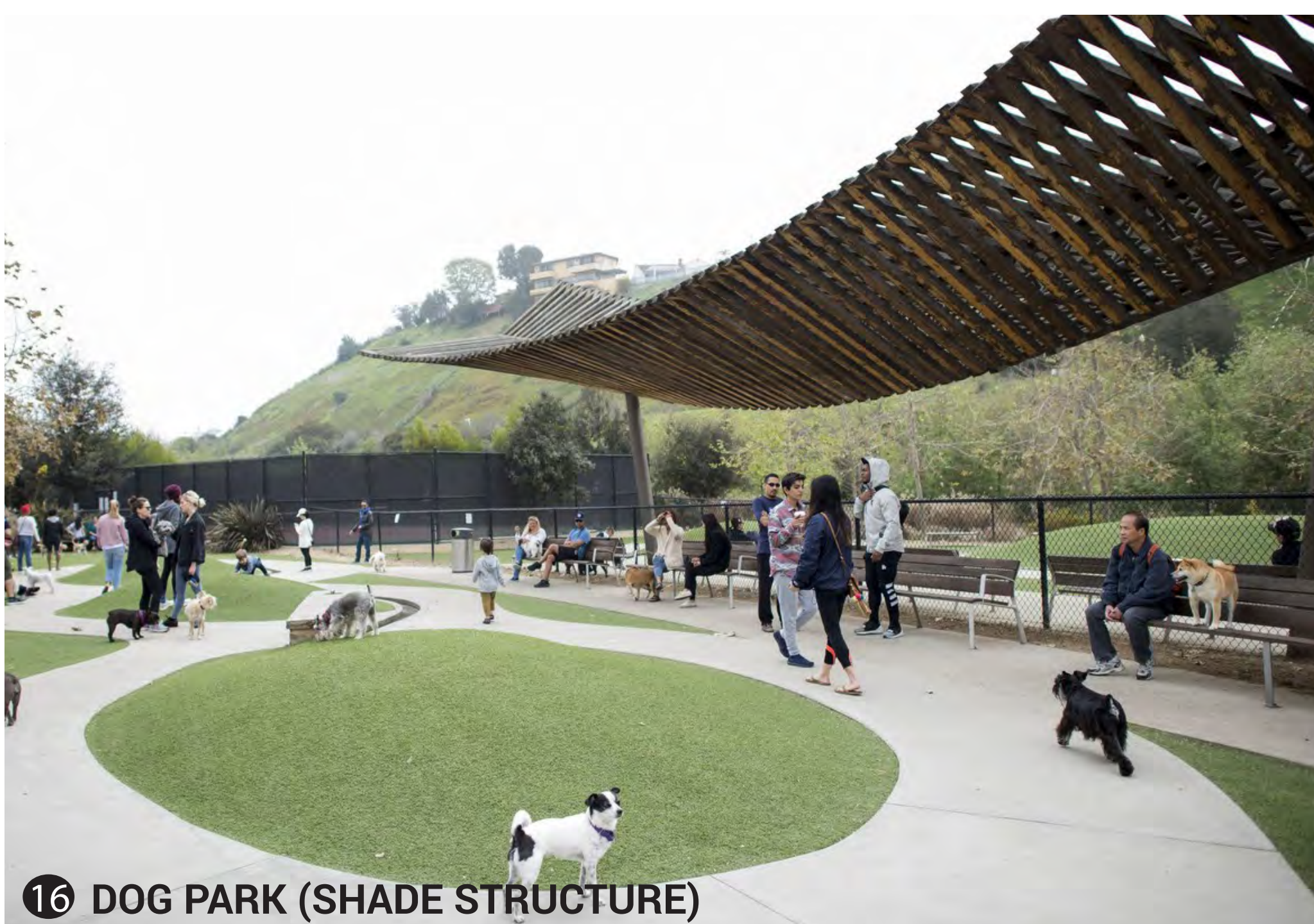
16 DOG PARK (SHADE STRUCTURE)