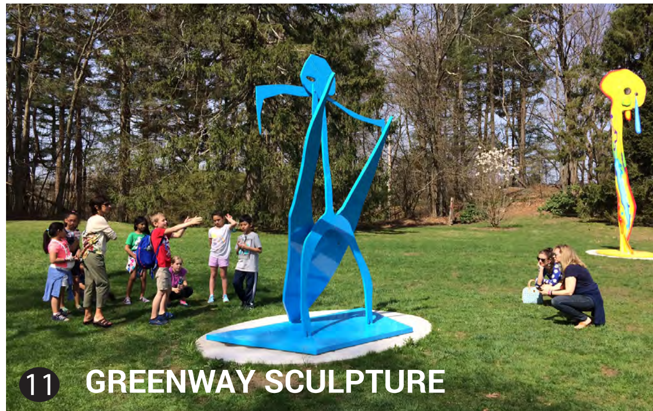
11 GREENWAY SCULPTURE