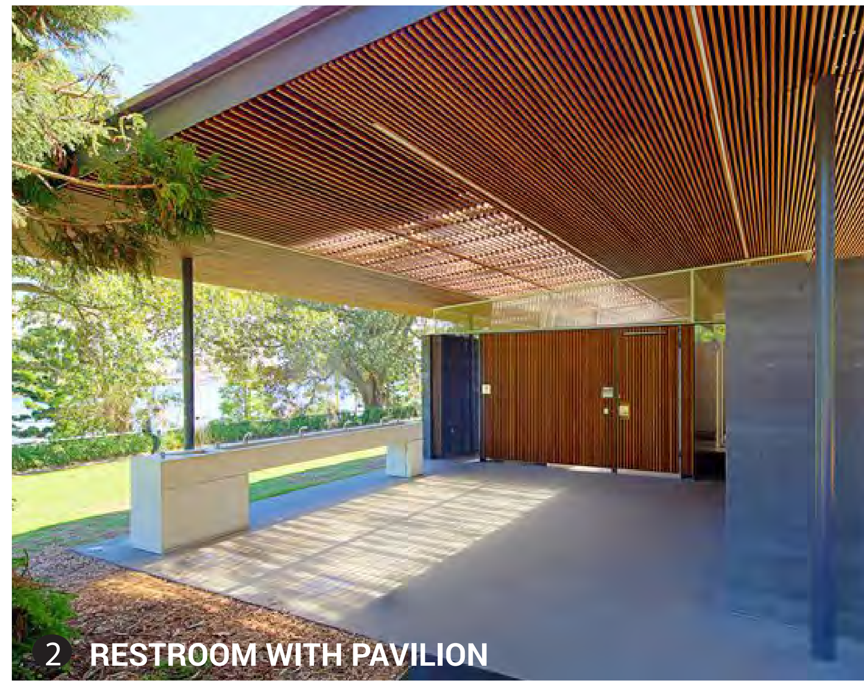
2 RESTROOM WITH PAVILION