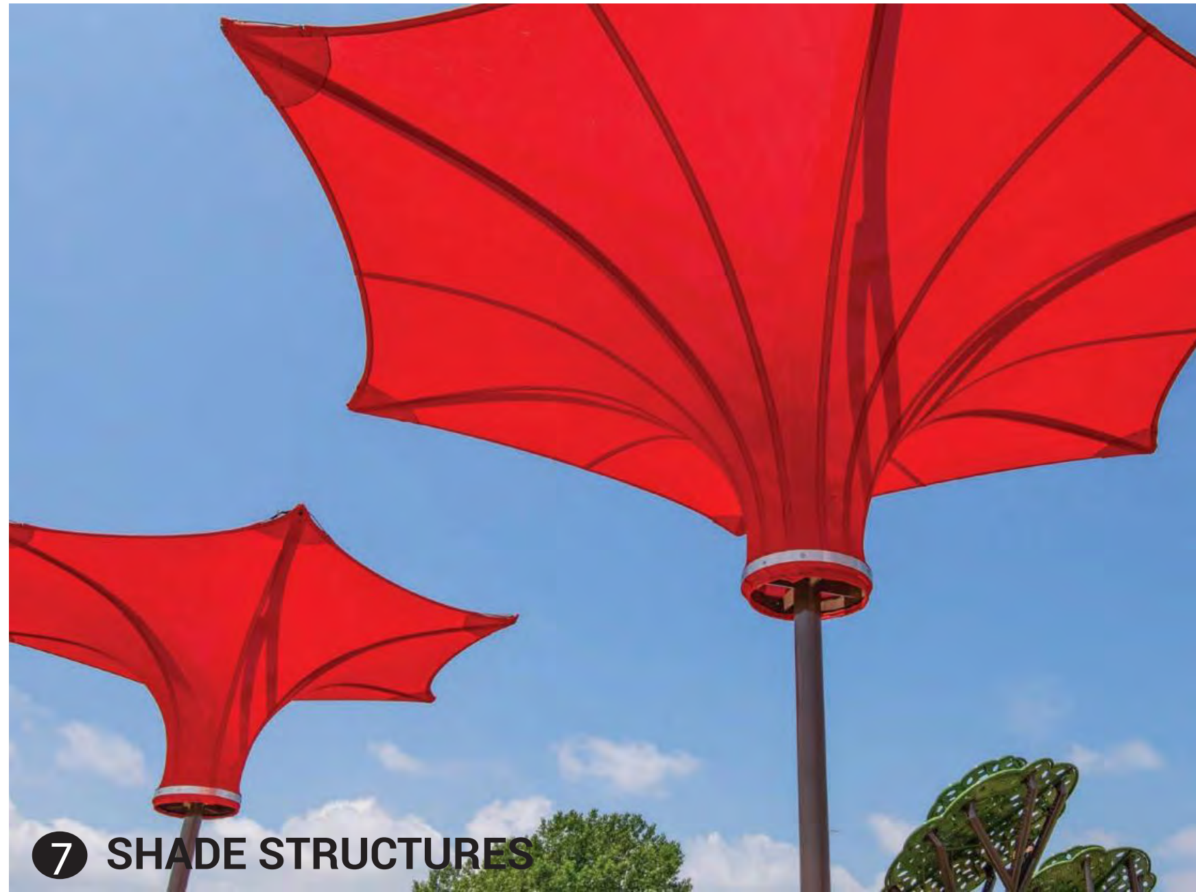
7 SHADE STRUCTURES