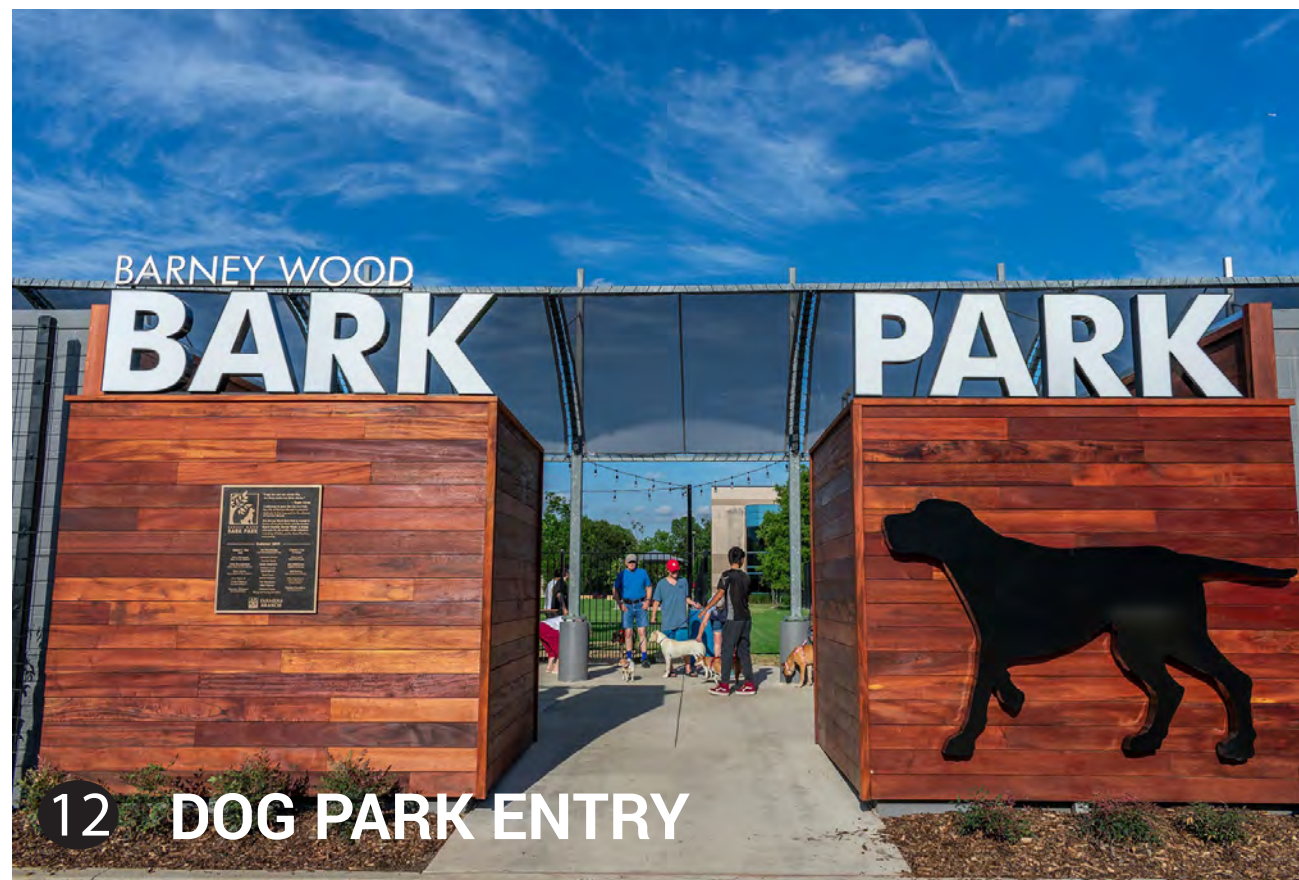
12 DOG PARK ENTRY