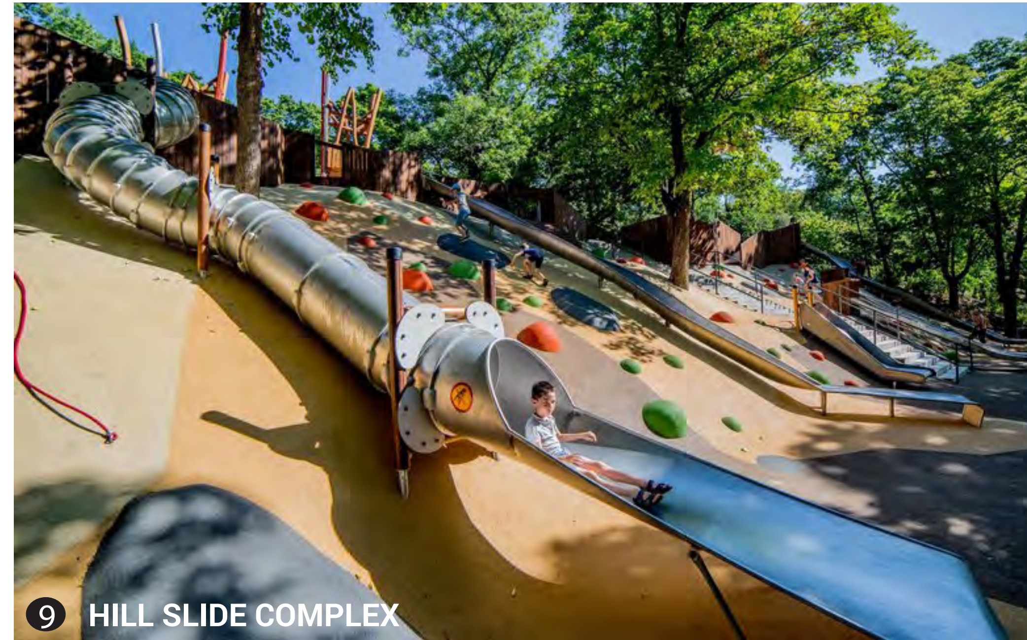
9 HILL SLIDE COMPLEX