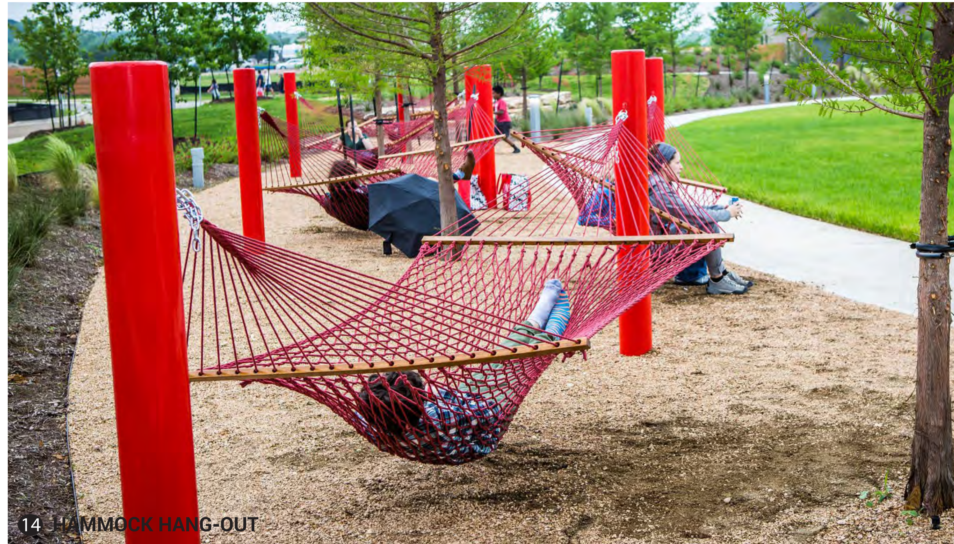
14 HAMMOCK HANG-OUT