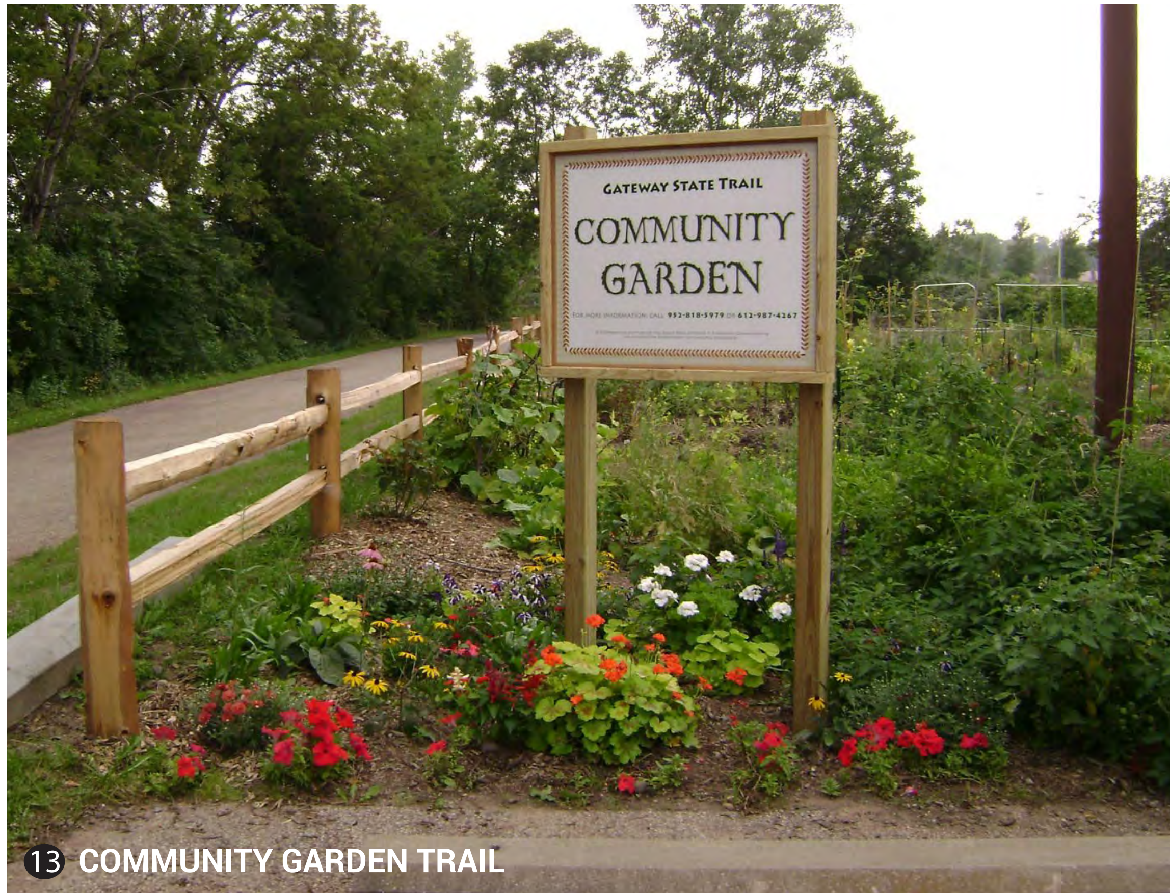
13 COMMUNITY GARDEN TRAIL