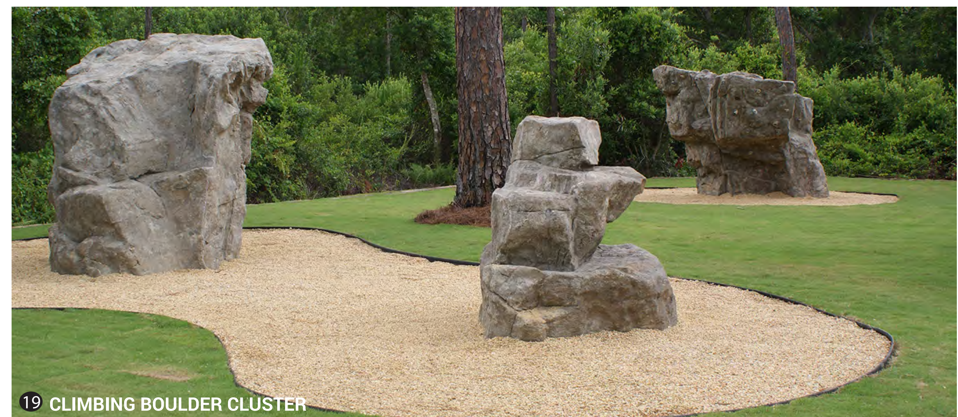
19 CLIMBING BOULDER CLUSTER