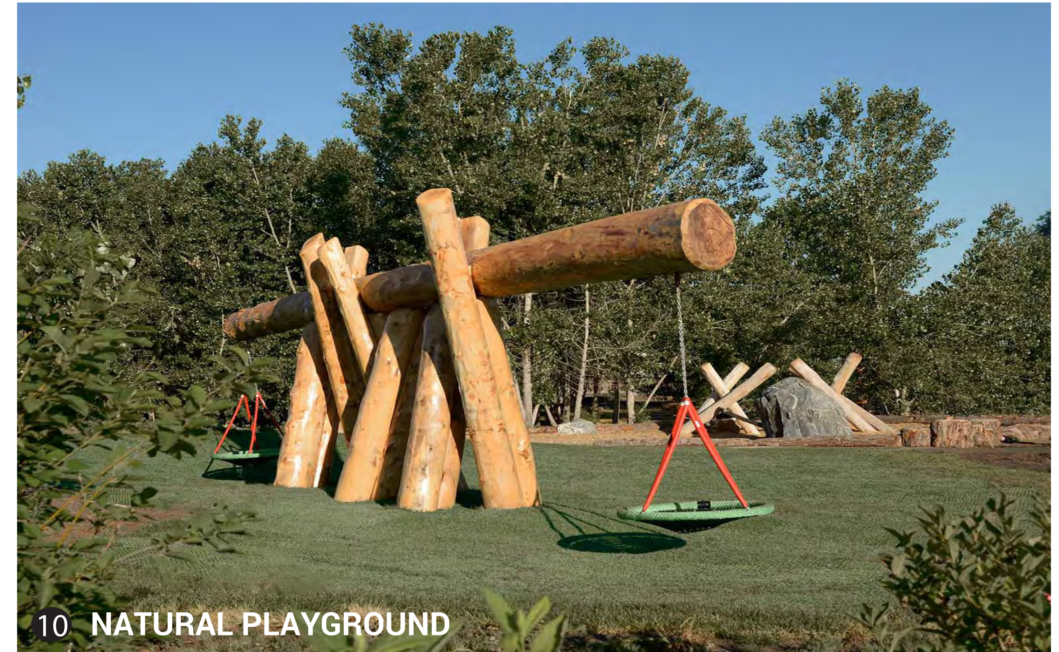
10 NATURAL PLAYGROUND