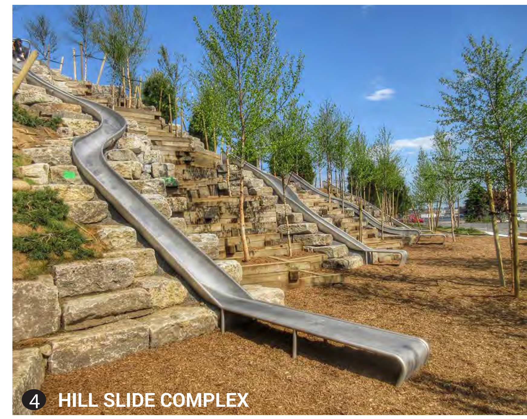
4 HILL SLIDE COMPLEX