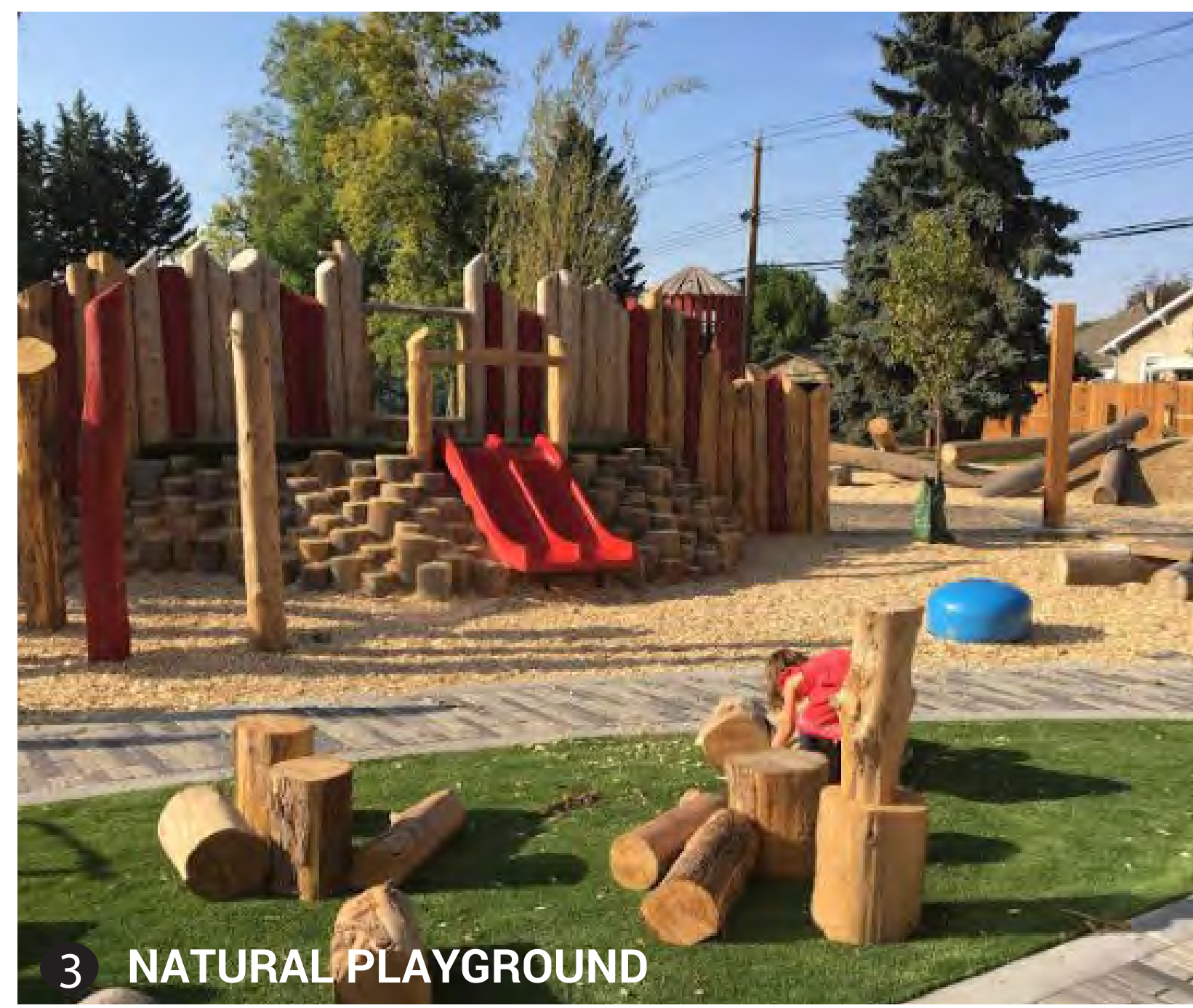
3 NATURAL PLAYGROUND